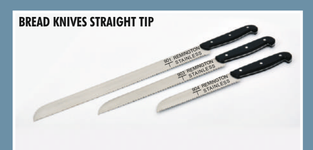
Code (Blade Size): 901 (16"/400mm), 902 (14"/350mm), 903 (12"/300mm) 904 (10"/250mm), 905 (8"/200mm)