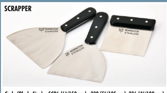
Code (Blade Size) : SCR6 (6"/150mm), 338 (5"/125mm), 336 (4"/100mm) SCR (4"/100mm)