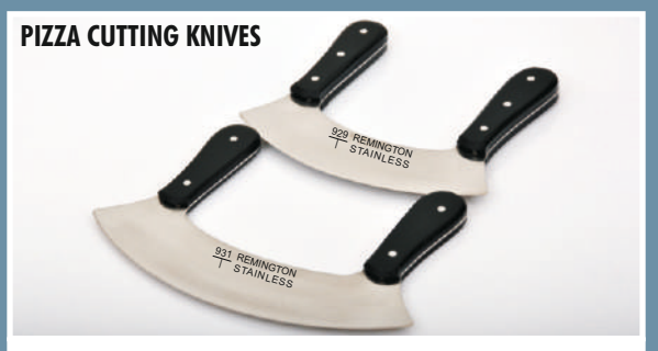
Code (Blade Size): 933 (12"/300mm), 935 (11"/275mm), 931 (10"/250mm) 929 (8"/200mm)