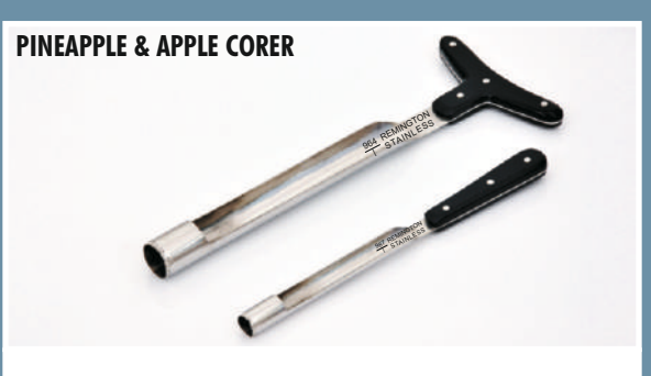
Code (Size): 964 (24mm), 987 (16mm), 986 (14mm), 985 (12mm)