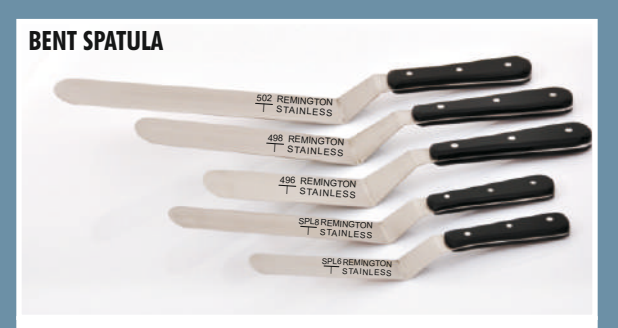
Code (Blade Size): 504 (12"/300mm), 502 (10"/250mm), 498 (8"/200mm) 496(6"/150mm)