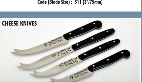
Code (Blade Size): 544 (6"/150mm), 542 (5"/125mm), 540 (4"/100mm) 1262 (6"/150mm), 1261 (5"/125mm), 1260 (4"/100mm)