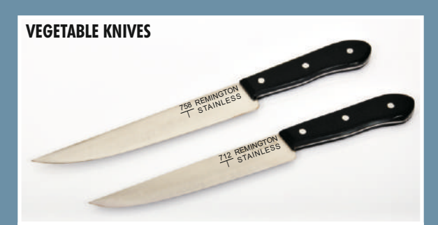
Code (Blade Size): 758 (8"/200mm), 712 (7"/175mm), 755 (6"/150mm) 754 (5"/125mm)