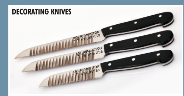
Code (Blade Size): 1132 (7"/175mm), 1032 (6"/150mm), 562 (5"/125mm) 560 (4"/100mm)