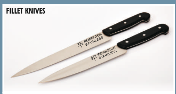
Code (Blade Size): 730 (9"/225mm), 842 (8"/200mm), 739 (7"/175mm) 840 (6"/150mm)