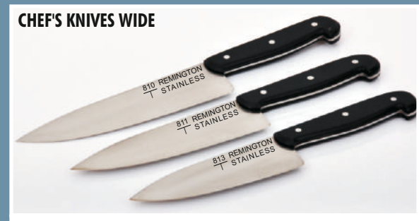
Code (Blade Size): 806 (10"/250mm), 807 (9"/225mm), 810 (8"/200mm) 811 (7"/175mm), 813 (6"/150mm), 814 (5"/125mm)