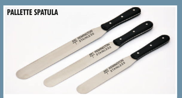
Code (Blade Size): 883 (14"/350mm), 882 (12"/300mm), 881 (10"/250mm) 880 (8"/200mm), 879 (6"/150mm)