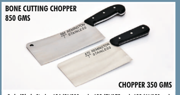
Code (Blade Size): 684 (8"/200mm), 683 (7"/175mm), 682 (6"/150mm) 871 (8"/200mm), 870 (7"/175mm), 781 (6"/150mm)