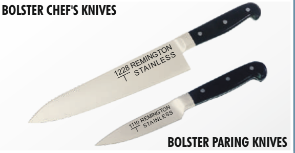
Code (Blade Size): 1229 (10"/250mm), 1228 (9"/225mm), 1227 (8"/200mm) 1114 (5"/125mm), 1112 (4"/100mm), 1110 (3"/75mm)