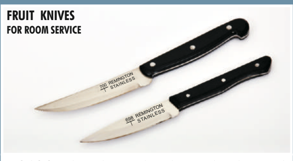
Code (Blade Size): 702 (5"/125mm), 700 (4"/100mm), 602 (3.5"/90mm) 674 (4"/100mm), 698 (3"/75mm)