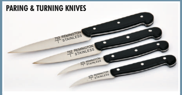
Code (Blade Size): 753 (5"/125mm), 752 (4"/100mm), 751 (3"/75mm) 680 (3.5"/90mm), 679 (3"/75mm), 678 (2.5"/60mm)