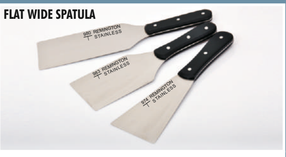
Code (Blade Size): 980 (7"/175mm), 979 (6"/150mm), 983 (5"/125mm) 975 (6"/150mm), 974 (5"/125mm), 973 (4"/100mm)