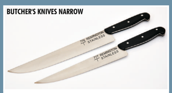
Code (Blade Size): 776 (12"/300mm), 797 (11"/275mm), 777 (10"/250mm) 796 (9"/225mm)