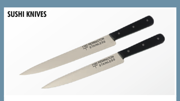
Code (Blade Size): 1162 (10"/250mm), 1160 (9"/225mm), 1158 (8"/200mm) 1156 (7"/175mm)