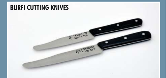
Code (Blade Size): 331 (7"/175mm), 330 (6"/150mm), 329 (5"/125mm) 332 (4"/100mm)