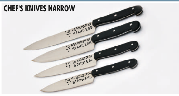
Code (Blade Size): 706 (10"/250mm), 707 (9"/225mm), 710 (8"/200mm) 711 (7"/175mm), 713 (6"/150mm), 714 (5"/125mm)