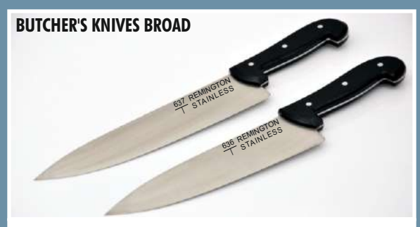
Code (Blade Size): 638 (12"/300mm), 637 (11"/275mm), 636 (10"/250mm) 635 (9"/225mm)