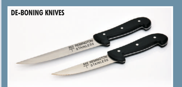
Code (Blade Size): 853 (8"/200mm), 851 (7"/175mm), 849 (6"/150mm) 847 (5"/125mm)