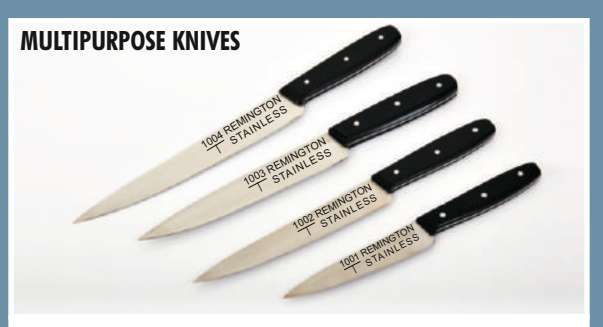
Code (Blade Size): 1004 (8"/200mm), 1003 (7"/175mm), 1002 (6"/150mm) 1001 (5"/125mm)