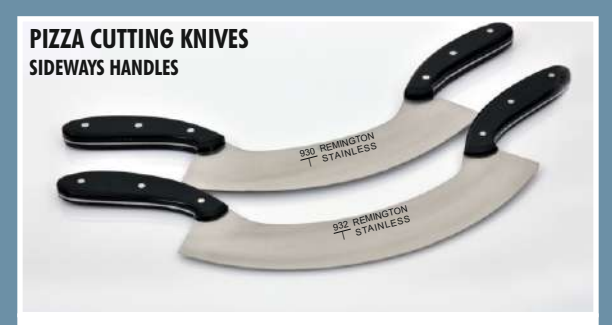
Code (Blade Size): 932 (12"/300mm), 934 (11"/275mm), 930 (10"/250mm) 928 (8"/200mm)