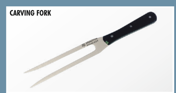
Code (Blade Size): 962 (8"/200mm), 961 (7"/175mm), 960 (6"/150mm) 959 (4"/100mm)