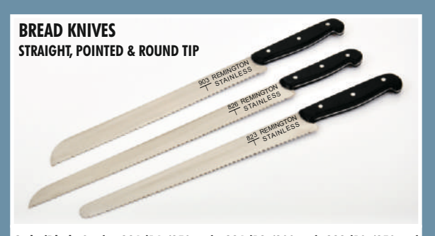
Code (Blade Size): 826 (14"/350mm), 824 (12"/300mm), 822 (10"/250mm) 825 (14"/350mm), 823 (12"/300mm), 821 (10"/250mm)