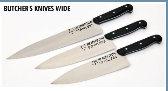
Code (Blade Size): 775 (12"/300mm), 770 (11"/275mm), 774 (10"/250mm) 789 (9"/225mm)