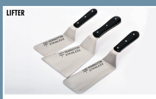
Code (Blade Size): 1083 (7"/175mm), 1081 (6"/150mm), 1075 (9"/225mm) 1073 (8"/200mm), 1071 (7"/175mm), 1082 (8"/200mm), 1080 (7"/175mm)